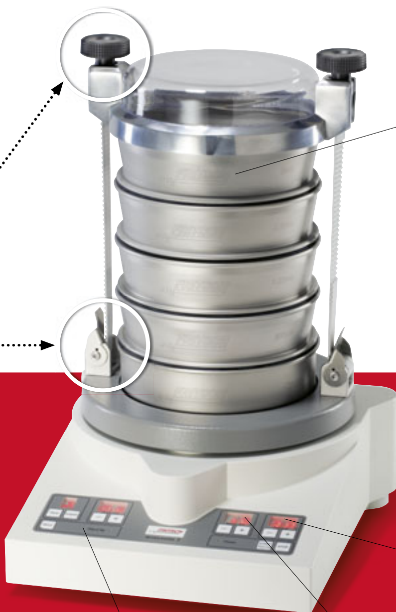
ANALYSETTE 3 PRO