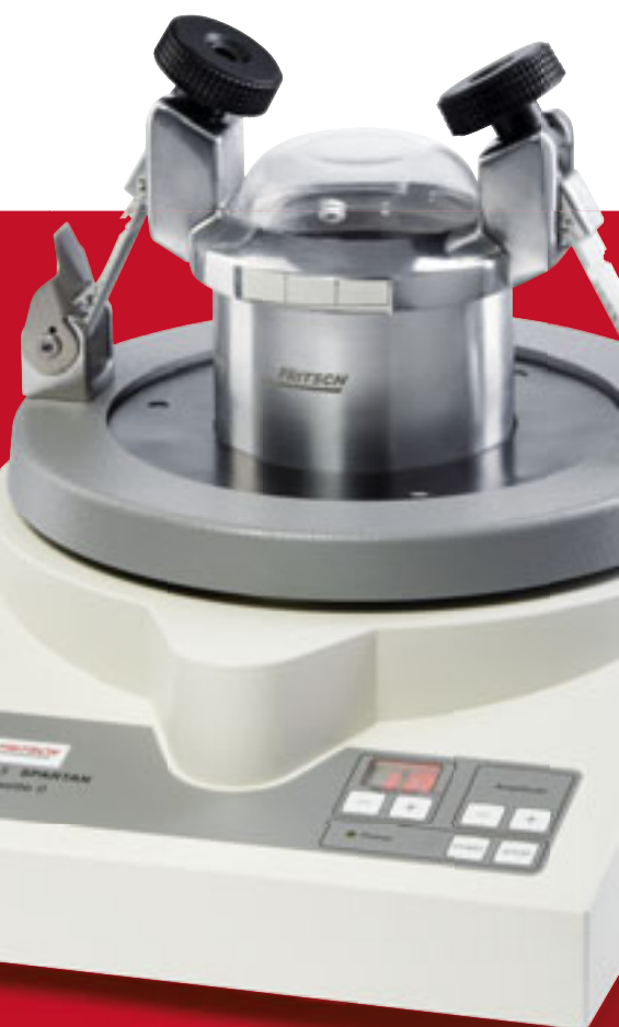
PULVERISETTE 0 Vibratory Micro Mill

*Depending on the material to be sieved and the sieves used