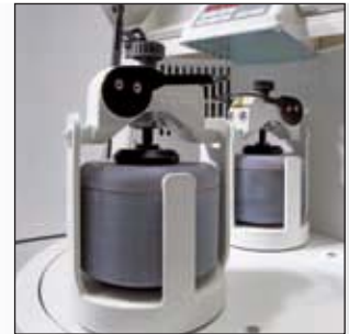
Also available: The p-5 classic line with 2 working stations