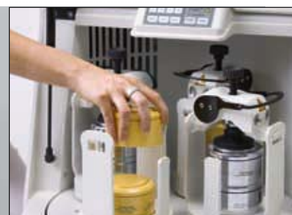
Saves time: Simultaneous grinding of up to 8 samples