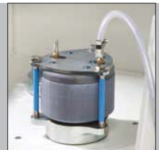
The PULVERISETTE 4 grinding in inert gas