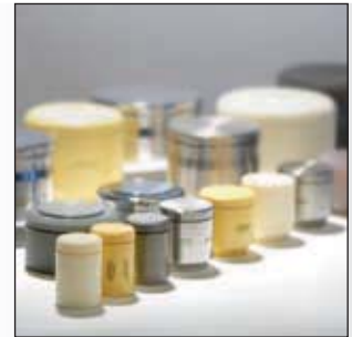
Particularly versatile: The FRITSCH grinding bowl programme