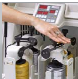
Fast and reliable: The practical Safe-Lock-System