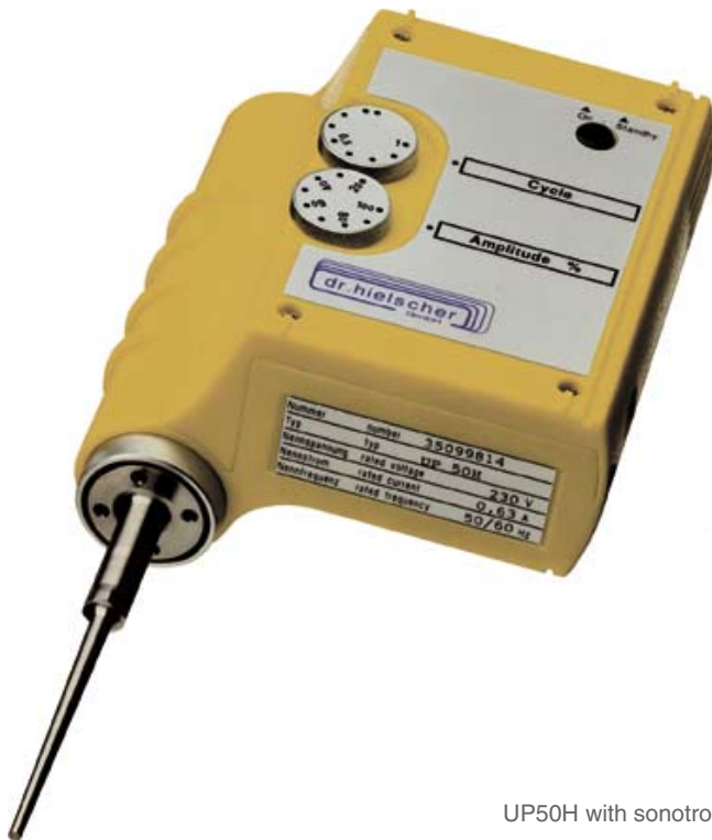
UP50H with sonotrode MS3

The ultrasonic processor UP50H (50 watts, 30kHz) is the smallest model of our aesthetic laboratory devices, that are only supplied by the Dr. Hielscher GmbH in that compact form. The UP50H is used in particular in medical, biological or chemical laboratories, in which small volumes are to be sonicated. Application fields are to be found mainly in the analytical field with applications such as the disruption of tissues, the cracking of bacteria or the homogenizing of samples in the food industry.