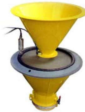
industrial ultrasonic sieving