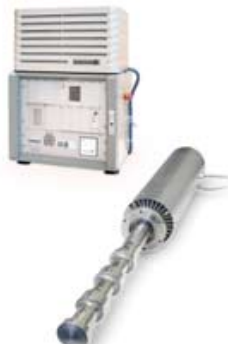
ultrasonic industry processors