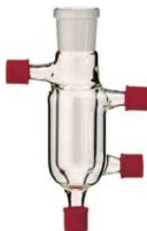
glass flow cell for UP100H

For our ultrasonic processor we offer flow cells made of glass or stainless steel. The liquid to be sonicated is lead in from below and passes through the cavitation zone under the sonotrode. The appropriate sonotrodes are equipped with O-rings, that are fitted closely to the cell wall or the PTFE-adaptor. For higher pressures and temperatures the sonotrodes may be equipped with metallic oscillating-free flanges that are mounted to the stainless steel flow cells. The selected flow rate corresponds to the energy input required. The temperature of the medium can be influenced by means of a cooling jacket. Special designs of the flow cell e.g. several supply connectors, when emulsifying are manufactured according to the demands of the customer. A new product in our product range is the mini flow cell (patent pending). When using this mini cell, the medium is hermetically sealed, so that the sonication can be realized without contamination.