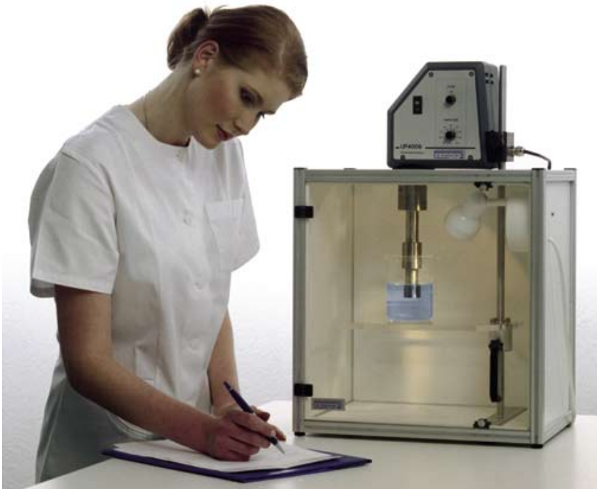
UP400S with H22 in sound protection box

The ultrasonic processor UP400S (400 watts, 24kHz) is our most powerful laboratory device. With sonotrodes of a diameter range from 3 to 40mm the device is suited for sample volumes from 5 to 2000ml. In flow approx. 10 to 50 liters per hour can be treated. For the preparation of test portions the UP400S is mainly used for bigger volumes. It is suited for the practical process development in the laboratory but also in the college of technology as well as for the production of small quantities. For production quantities a PC-control or a connecting lead to a central control of the user's plant is recommended in order to raise the process safety. With special flow cells and flange connections liquids can also be sonicated at high temperatures and pressures.