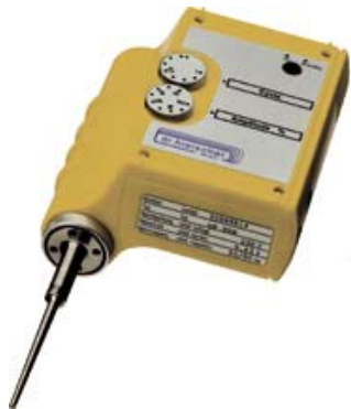
ultrasonic laboratory processors