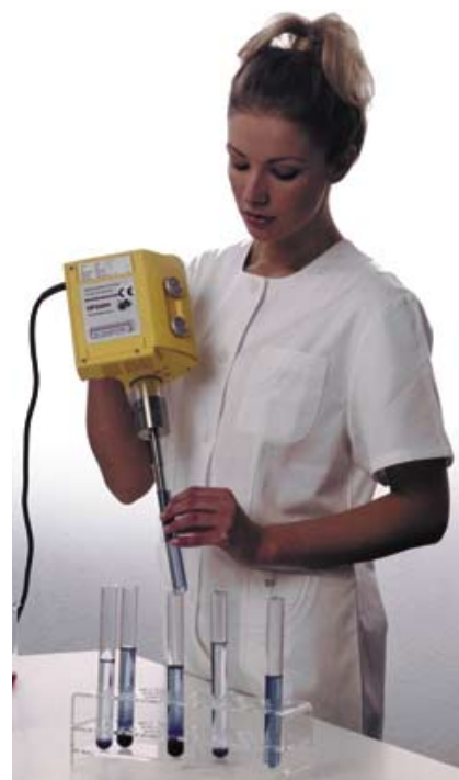
UP200H with S7

We offer a comprehensive range of accessories for the UP200H such as flow cells, stand, sound protection box, timer and PC- control.