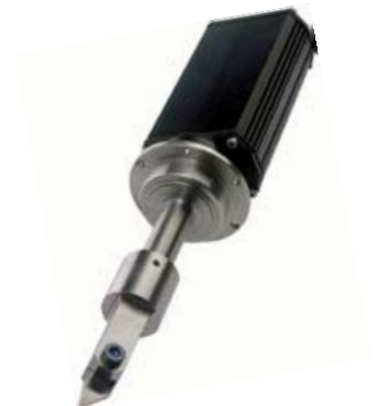
cutting and welding