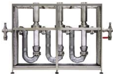
ultrasonic dispersing systems