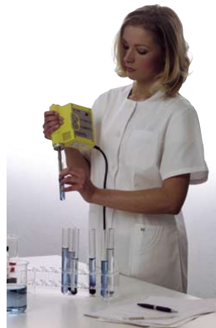
UP100H with MS7

For continuous operation only a flow cell and the appropriate 7mm sonotrode is required. Continuous processes in the smallest scale can be simulated. The optional PC-control may be helpful, if a test record is necessary or to optimize processes.