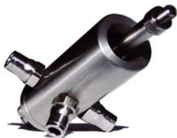
stainless steel flow cell D7K with MS7D