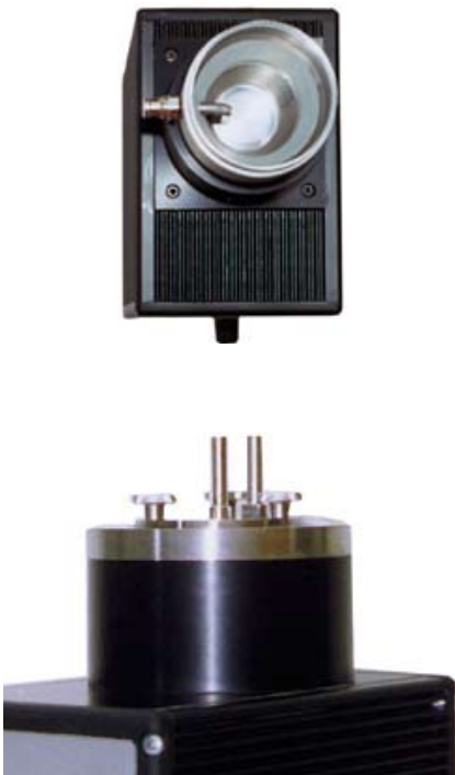
UTR200 as reactor chamber

The sonoreactor UTR200 (200 watts, 24kHz) works as an ultrasonic bath but at a 50 times higher intensity. In addition, it is dry-running protected. It is suited for the direct or indirect sonication of liquids e.g. for cell disruption, homogenizing or emulsifying. The beaker-shaped sonotrode is machined from one piece in order to prevent leakages. The upper part of the sonotrode is oscillation-free and can be used for mounting the respective accessories for diverse application cases. A corresponding reactor cover takes the Eppendorf tubes or test tubes for indirect sonication. By means of the reactor cover the chamber is hermetically sealed. If the cover has an additional inlet and outlet the sonoreactor can be used as a flow system. A sieving extension with a bajonet lock takes a pile of sieves for fine grain sizes (diameter 75mm, finest mesh size 5 micron). The ultrasound, which is transmitted to the sieves, accelerates the wet sieving process.