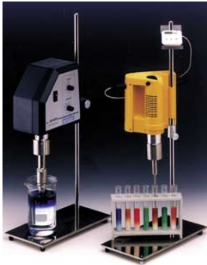
UP400S and UP200H with timer

Since working surface in the laboratory is expensive we supply ultrasonic processors with a compact design: Power supply, generator, control and transducer, all of which are located in an aesthetic housing. No additional cables impede.