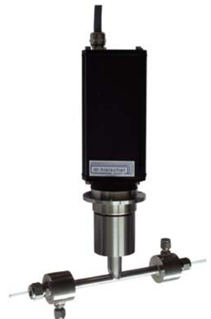
UIP250H56 with mini flow cell Dmini

For our ultrasonic processor we offer flow cells made of glass or stainless steel. The liquid to be sonicated is lead in from below and passes through the cavitation zone under the sonotrode. The appropriate sonotrodes are equipped with O-rings, that are fitted closely to the cell wall or the PTFE-adaptor. For higher pressures and temperatures the sonotrodes may be equipped with metallic oscillating-free flanges that are mounted to the stainless steel flow cells. The selected flow rate corresponds to the energy input required. The temperature of the medium can be influenced by means of a cooling jacket. Special designs of the flow cell e.g. several supply connectors, when emulsifying are manufactured according to the demands of the customer. A new product in our product range is the mini flow cell (patent pending). When using this mini cell, the medium is hermetically sealed, so that the sonication can be realized without contamination.