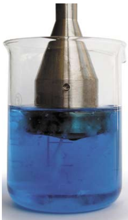
cavitation at S40

The ultrasonic processor UP200S (200 watts, 24kHz) differs from the UP200H only with its shape and its use only with stand.