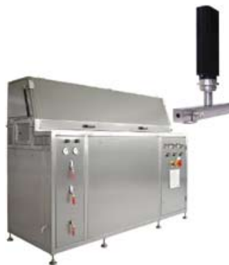
wire-, tape- and profile cleaning