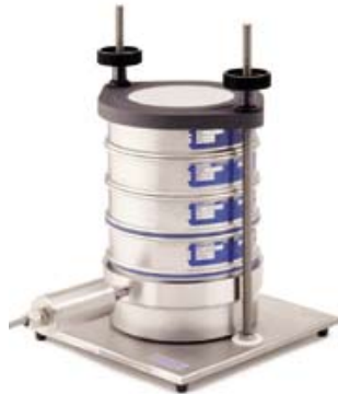
ultrasonic sieving in the laboratory