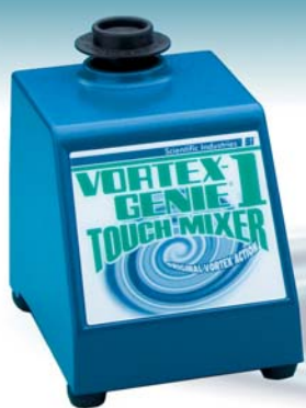
HIGH SPEED MIXER