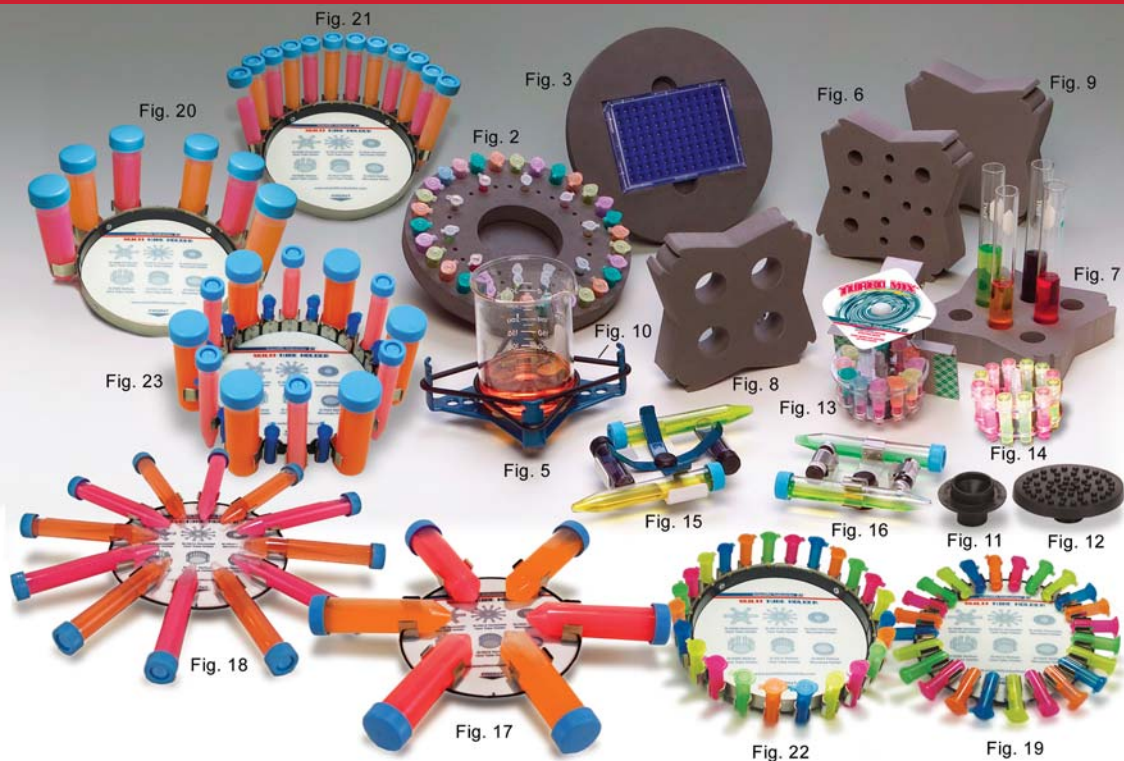
Fig. 1 Model H301 Multiple Sample Starter Set

Accessories for all Vortex-Genie® 2 mixers and Vortex-Genie® Pulse