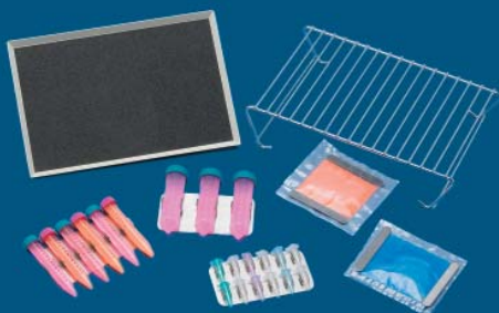
Accessories Supplied with Unit