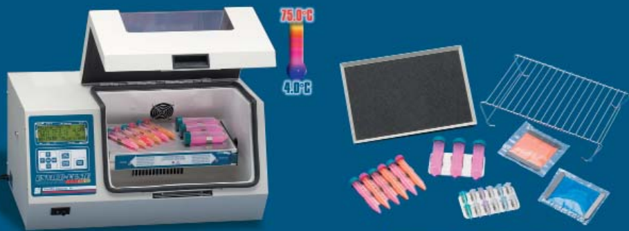
Accessories Supplied with Unit