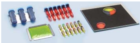
Accessories Supplied with Unit