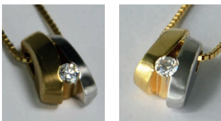
Removal of polishing pastes