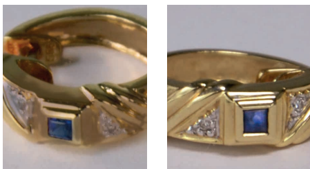
Removal of wear dirt