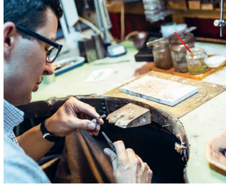
Cleaning of rings, necklaces, earrings, etc.