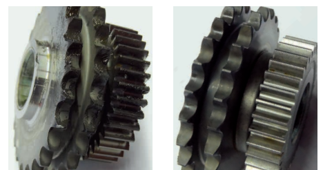
Removal of grease and silicone