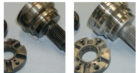
Removal of oxidation and other contaminants