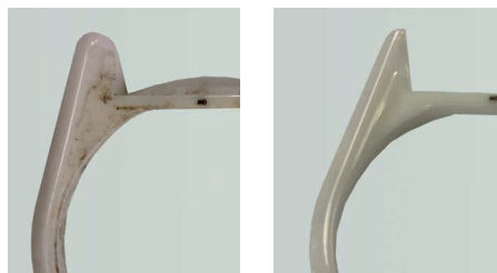
Removal of polishing pastes