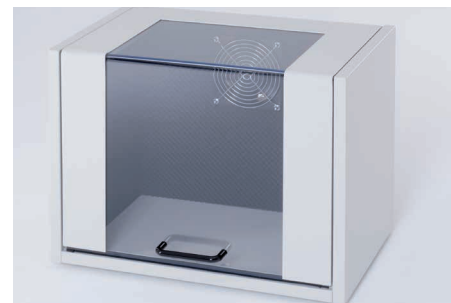
Noise protection box