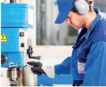
Industrial parts cleaning of motor parts, filters, etc.

Robust tabletop ultrasonic devices for heavy-duty applications