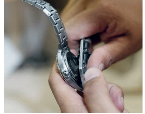
Cleaning of watch parts like straps, cases, etc.

Elmasonic xtra TT tabletop ultrasonic devices are designed for use in production environments, workshops and servicing. Features like the permanently integrated Sweep-function, the switchable Dynamic-function or the individually settable limit temperature with LED warning indicator make the cleaning of parts in day to day work much easier.